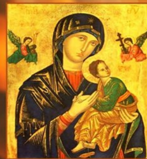
Our Mother of Perpetual Help

Mother of Perpetual Help, with the greatest confidence we come before your holy picture to beseech your intercession. We think of you, Mother, at the foot of the Cross. Your heart must have bled to see your Son in agony. But your joy was great when He rose from the dead, victorious over the powers of evil. Mother of Sorrows, pray for us in this time of trial.