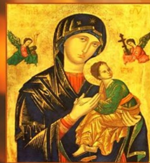
Our Mother of Perpetual Help

Mother of Perpetual Help, with the greatest confidence we come before your holy picture to beseech your intercession. We think of you, Mother, at the foot of the Cross. Your heart must have bled to see your Son in agony. But your joy was great when He rose from the dead, victorious over the powers of evil. Mother of Sorrows, pray for us in this time of trial.