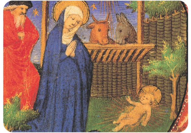
THE OFFICE OF THE BLESSED VIRGIN MARY, ATTRIBUTED TO JACOBUS COEN

Nativity scenes, though, are not an attempt to present a historically accurate picture of where Jesus was born. Rather, scenes of the birth of Jesus remind us of the special love that God shows for us in sending the Son to us. We do not care so much about creating an exact picture of what took place as we do of beholding the beauty and wonder of God born among us. ●