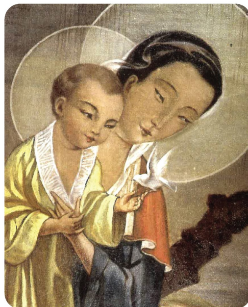
VIRGIN AND CHILD, ASIA (ARTIST UNKNOWN)

Recall, too, that Jesus and his disciples spoke Aramaic, and there is no equivalent for the meaning of "cousins" as we know it in that language. Instead, the word for brother or sister was used when referring to cousins. Thus, when St. Jerome ( circa 340–420) translated the Bible from Hebrew into Church Latin, he considered "the brothers of Jesus" as cousins, not siblings. After all, it would have been the rightful responsibility of these male relatives of Jesus to take care of Mary when Jesus died. Yet Jesus entrusts his mother to the care of his beloved disciple John (John 19:26). ●