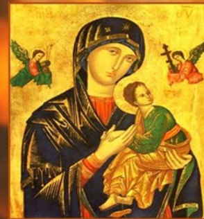
Our Mother of Perpetual Help

Mother of Perpetual Help, with the greatest confidence we come before your holy picture to beseech your intercession. We think of you, Mother, at the foot of the Cross. Your heart must have bled to see your Son in agony. But your joy was great when He rose from the dead, victorious over the powers of evil. Mother of Sorrows, pray for us in this time of trial.