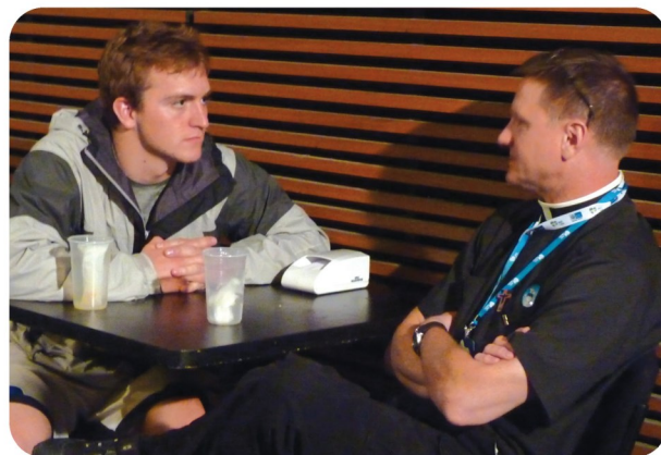
A pilgrim takes time during a World Youth Day event to speak with a priest about vocations.

If you are truly open to the will of God in your own life, if you are willing to listen to God’s call and make your decisions and choices based on this experience, preferably with the guidance of a confessor or spiritual director, you will discover the true happiness that a real vocation can bring. ●