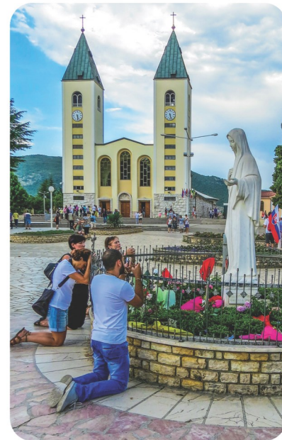
PRAYING IN FRONT OF THE STATUE OF OUR LADY MARY, MEDJUGORJE, BOSNIA AND HERZEGOVINA.

It is important to note whether the private revelation is contrary to the faith or the morals of the Church, and whether a particular revelation brings one closer to God. ●