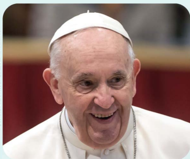
STEFANO DAL POLOZZO / CNS

December 8 Second Sunday of Advent Bar 5:1-9 Phil 1:4-6, 8-11 Lk 3:1-6