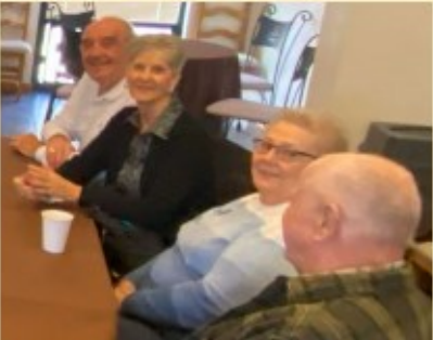
A BIG thank you to all our parishioners who once again supported our charitable works!