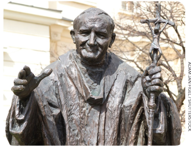
Sculpture of a smiling Pope St. John Paul II outside the Saint John the Baptist Cathedral in Trnava, Slovakia.

Saint Irenaeus (125–202) said that the glory of God is the human fully alive which reflects Jesus' own words, "I came so that they may have life; and have it more abundantly" (John 10:10). Saints enjoy life! The nearsighted St. Alphonsus Liguori (1696–1787), founder of the Redemptorists, sat in the back row of the Naples theater with his glasses off so he could enjoy the music he loved without the distraction of the half-naked chorus line. Saint Teresa of Ávila (1515–1582), caught devouring partridge in the convent kitchen, said, "When I pray, I pray; when I eat partridge, I eat partridge!" Saint Joan of Arc (1412–1431) loved horses, and St. Charles Borromeo (1538–1584) loved chess. Indeed, saints do smile. They even laugh. ●