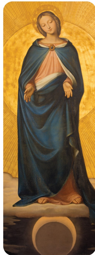
IMMACULATE CONCEPTION BY PHILIPP VEIT (1830)

Mary's Immaculate Conception was celebrated many centuries before Pope Pius IX defined it as dogma on December 8, 1854: "The doctrine that maintains that the Blessed Virgin Mary in the first instant of her conception, by a unique grace and privilege granted to her by Almighty God, in consideration of the merits of Jesus Christ the Savior of mankind, was preserved free from all stain of original sin, is a doctrine revealed by God and therefore must be firmly and constantly believed by all the faithful" ( Ineffabilis Deus ). In fact, eight years before, in 1846, the bishops of the United States had already adopted the Immaculate Conception as the patronal feast for Catholics in this country.