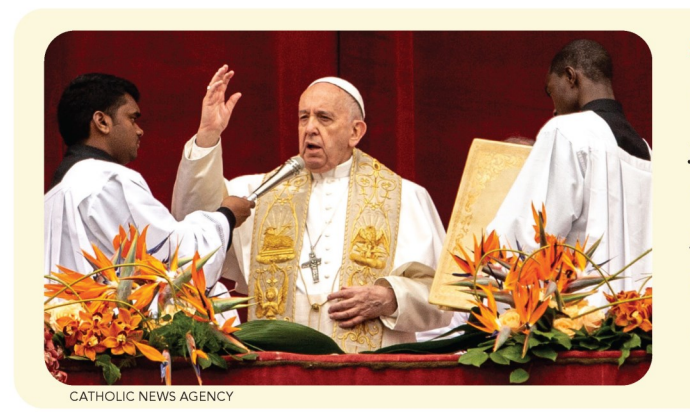
A WORD FROM POPE FRANCIS

Go to DearPadre.org to send your question and to learn more about Dear Padre .