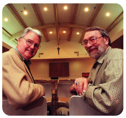
A candidate and his sponsor sit for a photo after an Order of Christian Initiation for Adults (OCIA) class.

I would also recommend that you "beef up" your understanding of what it means to be a practicing Catholic. You might do this by participating in your parish's process for the Christian Initiation of