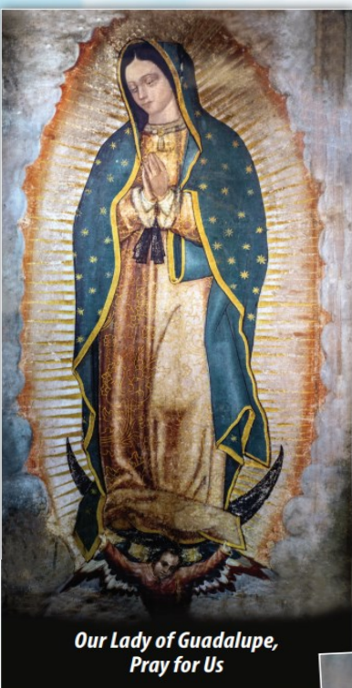
Our Lady of Guadalupe, Pray for Us

Todos los monaguillos están invitados a la Celebración del Rosario de Arizona. Los monaguillos de toda la Diócesis de Tucson están invitados a asistir a la Celebración del Rosario de Arizona en Tucson el sábado 18 de octubre de 2025, de 10:00 a. m. a 12:15 p. m. Este año, la Diócesis de Tucson celebrará el evento en la Iglesia Católica St. Elizabeth Ann Seton, 8650 N. Shannon Road, Tucson, AZ. Los monaguillos de toda la diócesis tienen un papel importante en esta celebración, y se les obsequiará con una Medalla Milagrosa que ha sido bendecida por el Papa León XIV. Después de la celebración,